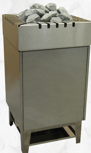
Type 44 „GSK“ – Model Greater Stone Container