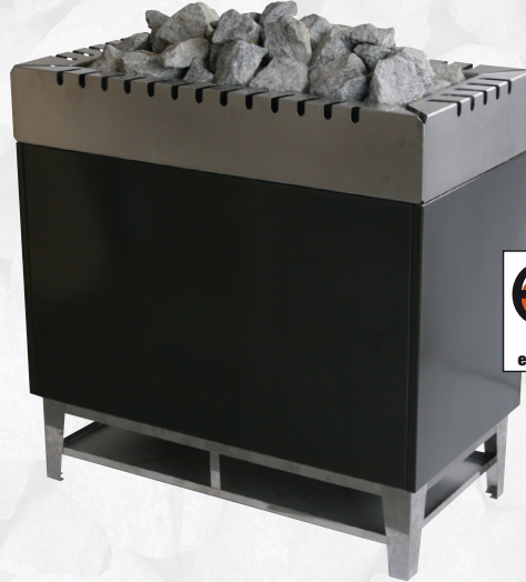
Type 84 „GSK“ – Model Greater Stone Kontainer