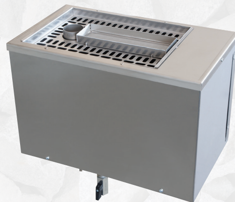
Type W 20