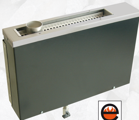
Type W 10