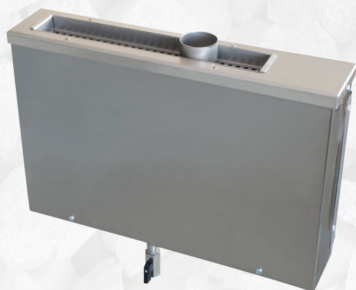
Type W 10